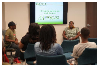
Business entrepreneurship class