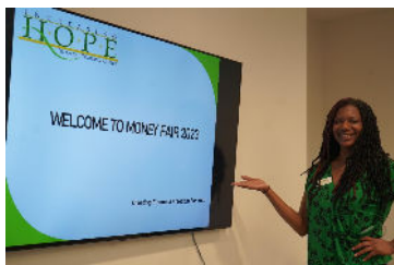
Welcome to Money Fair 2023

Over 100 ladies and gentlemen attended the event, participated in financial literacy education classes on business entrepreneurship, housing and credit, and talked with vendors from a variety of local industries. We want to thank all of our sponsors, supporters, vendors, and attendees for making another Money Fair a huge success.