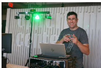
Live music by DJ E