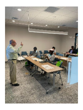
Free financial education classes