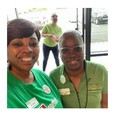
Bright, smiling faces

If you attended last year's Money Fair, we would love to get some feedback from you to help make this year's event even better. Please take a few minutes and click the survey link below. Thank you.